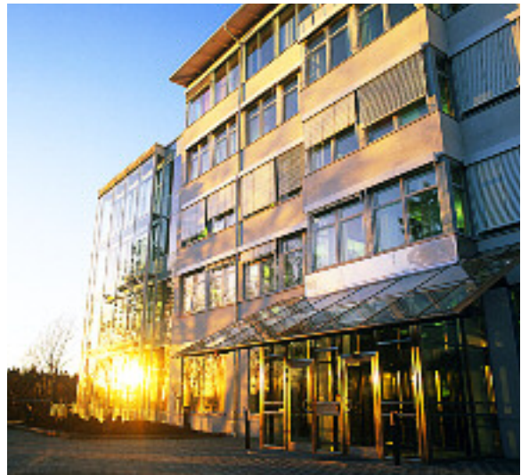
Helgafjäll 7 in Kista